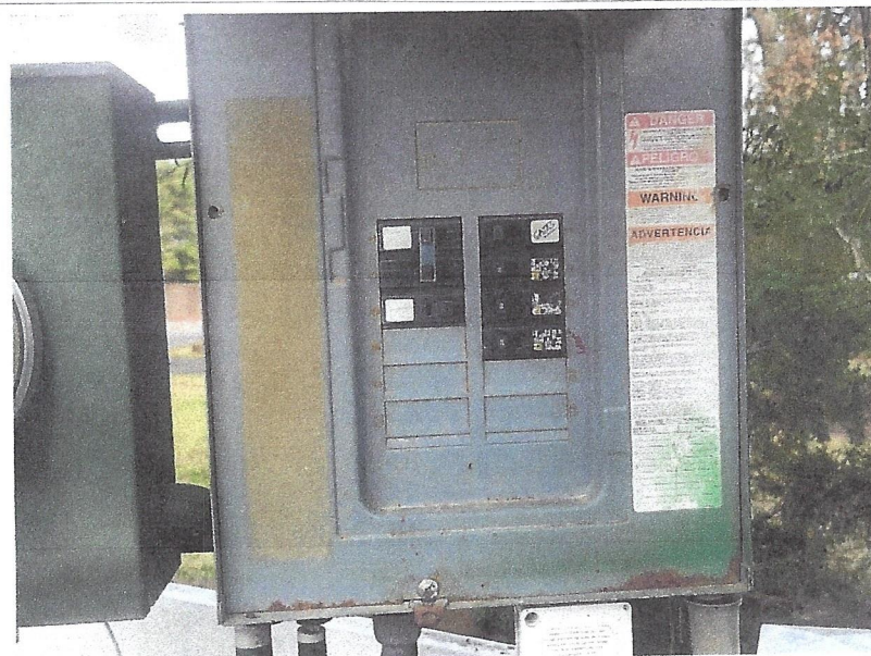
Ranch Creek Way breaker (upper right)