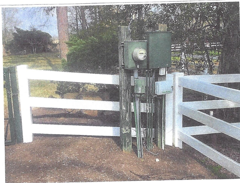
Ranch Creek Way breaker box (on right)