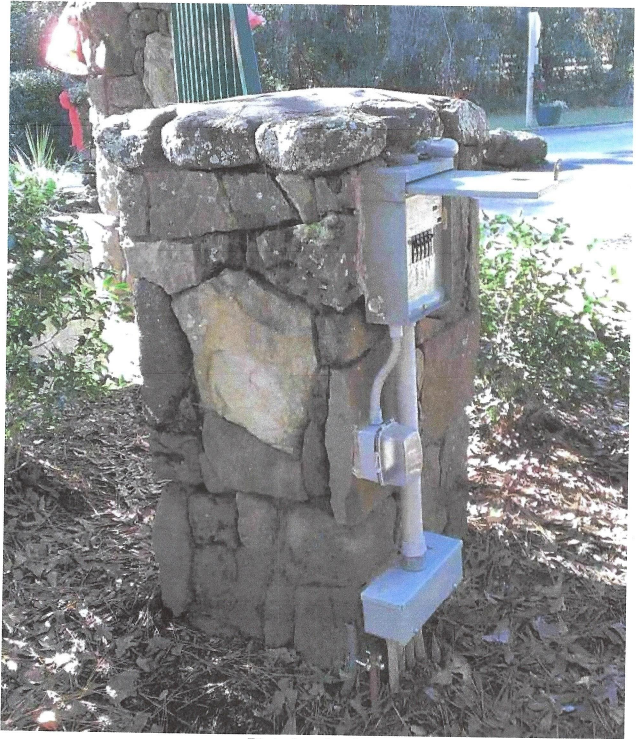
Riata breaker box